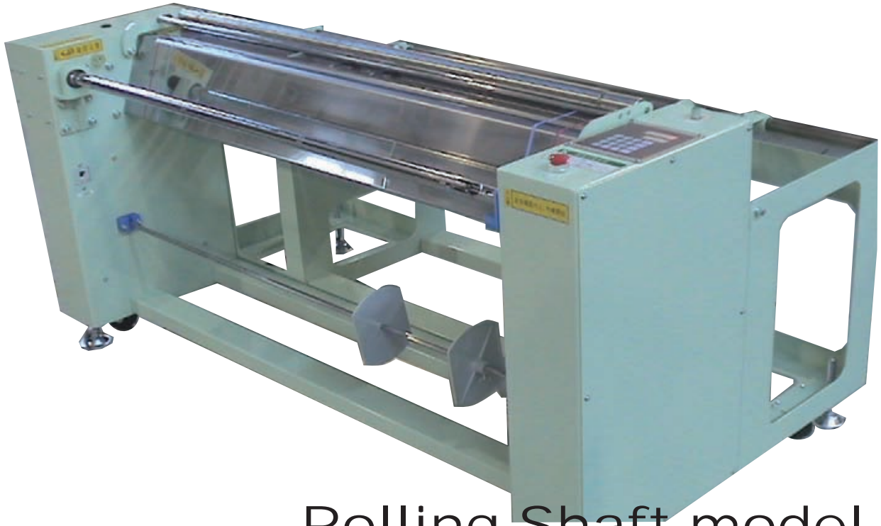
Rolling Shaft model

Measuring and Rolling machine for wallcoverings. This machine measures length, and rolls the wallcovering automatically. Operation is very easy. Input the datas of length, and press the start button!