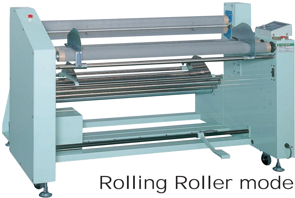
Rolling Roller model

Measuring and Rolling machine for wallcoverings. This machine measures length, and rolls the wallcovering automatically. Operation is very easy. Input the datas of length, and press the start button!